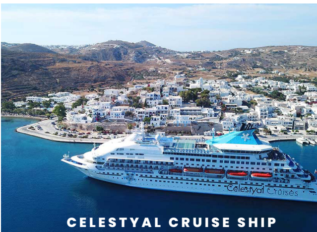
CELESTYAL CRUISE SHIP